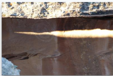
Another Solstice Marked