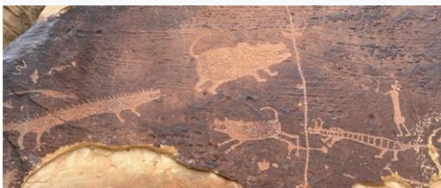
Ancient Critters or Mythical Beasts